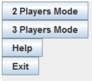
Figure 1 - Main menu

From main menu, player can choose between two player mode and three player mode. For players who are not familiar with this game, help function is available to support them with detail explanations about game rules.